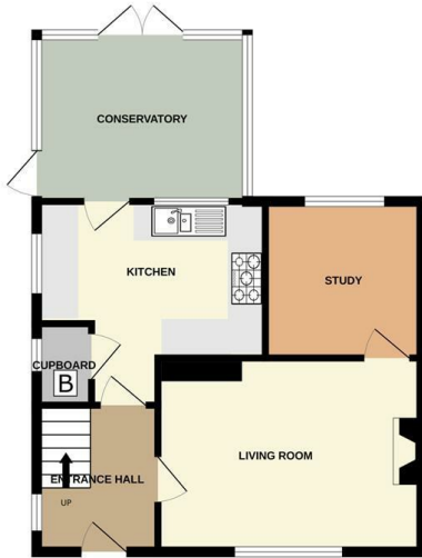
GROUND FLOOR 514 sq.ft. (47.7 sq.m.) approx.